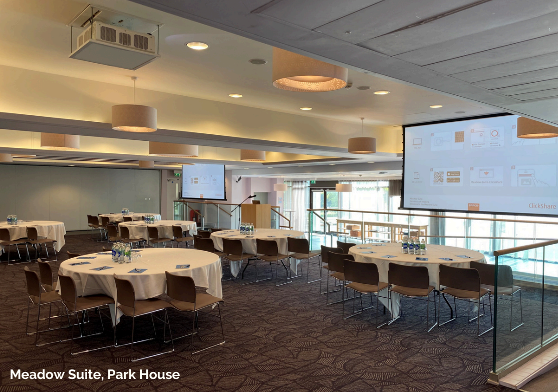
Meadow Suite, Park House